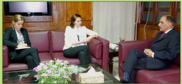
6 th October, 2009: Ms. Rebekah Grindlay, Australian Deputy High Commissioner, visited Peshawar High Court

The event was aimed at discussing the challenges, the District Judiciary is confronted with and to dedicate the day to make resolution to serve the litigant public better and meet the increasing expectations of society from the judiciary. It was also meant to make plans and devise strategies, to face the challenges, including the backlog, prolonged pendency of cases to improve the image and credibility of judiciary. It also provided an opportunity to set targets, to attain the objectives and goals and to overcome the obstacles, hindrances and hurdles, preventing the judiciary from achieving actual cause of dispensation of expeditious, inexpensive and impartial justice.