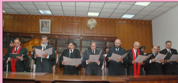
Oath Taking Ceremony of Seven New Judges

because selection to such posts is a sacred duty and they become disqualified for appointment, especially after showing their desire...It (court) consolidates its authority when it gently points the nation in the right direction instead of trying to dominate it".