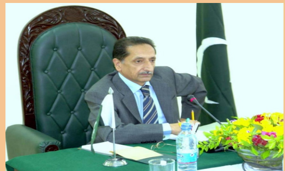
31st October 2009: Address to the District & Sessions Judges

We are, at the moment, in a state of crisis. Much more is expected of everybody. It is the worst which calls forth the best in you. Corruption is rampant in every department of life. It is a cancer. But it is still in a stage where it can be cured. It can be treated provided we make wholehearted efforts. If state of corruption is a thesis, it must have its antithesis. If corruption, chaos and confusion in this society are a thesis, it is bound to have its anti thesis. But this anti thesis will not descend from the heavens. We are to make efforts to bring about anti thesis. We are to hasten that dialectical process whereby this anti thesis can be brought about sooner than it is expected.