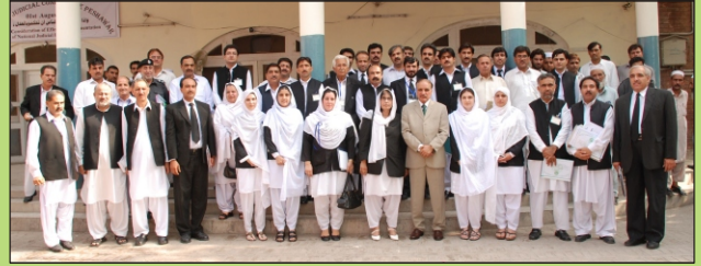
1st August 2009: District Judicial Conference, Peshawar

for putting in their best efforts to ensure expeditious dispensation of justice.