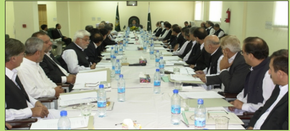
31 st October, 2009: District & Sessions Judges Attending the Meeting with Hon'ble the Chief Justice

All the District & Sessions Judges assured that they would do their best to achieve all the standards of performance prescribed by the hon'ble High Court and the National Judicial (Policy Making) Committee, by ensuring that the delay in dispensation of justice would be done away with and the most effective measures would be adopted to uproot the corruption of all kinds.